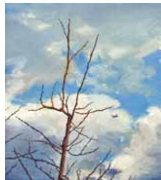
Joel Adas, Branches, Clouds, and a Plane II, 2007

SAT, SUN, APRIL 25, 26 Celebrate Arbor Day with tours led by artists and curators of the Arbores Venerabiles exhibition. GLYNDOR GALLERY, 2PM