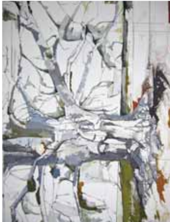
Jill Lear , 40° 58' 59.81" N 73 ° 54' 41.76" W (Copper Beech 11142008), 2008