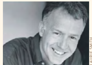
Reed Birney reads Dickens, November 22

Director and actor recreate a reading of "Doctor Marigold" and "Mr. Bob Sawyer's Party", first given by Charles Dickens in 1868 at New York's Steinway Hall and in Albany, NY.