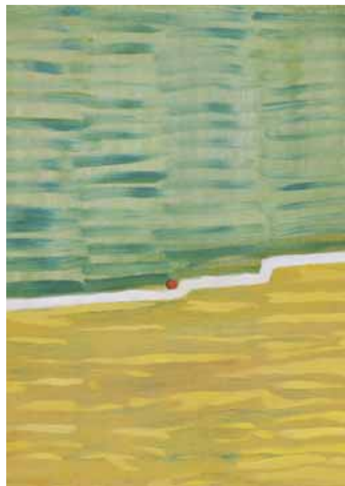
Calvin Burton, Belt