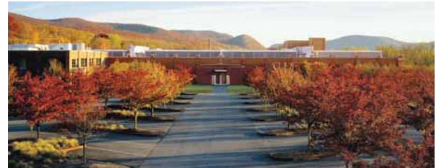
Members' Day Trip to DIA: Beacon, Monday, January 23.