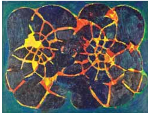
Terry Winters, Line , 2010