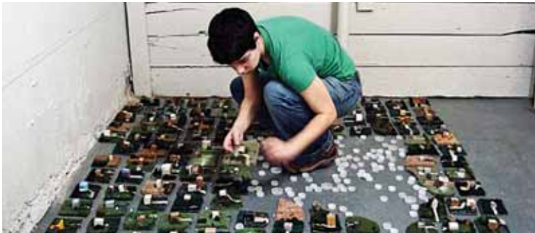
Max Liboiron, Material Afterlife: Circulation , 2009. Courtesy of the artist.