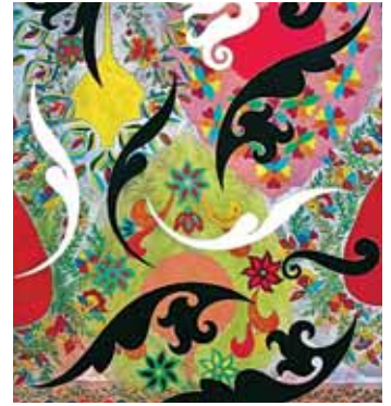
Philip Taaffe, Composition with Ornamental Fragments I , 2009 (detail)