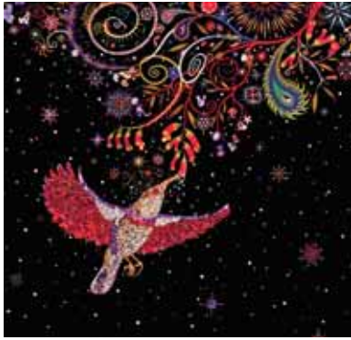
Fred Tomaselli, Big Hummingbird , 2004