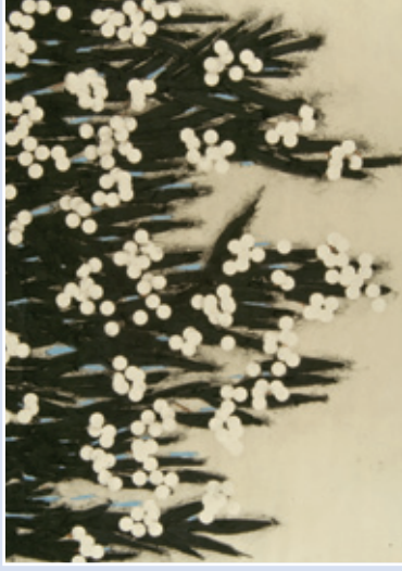
Donald Sultan, Mimosas , 2008