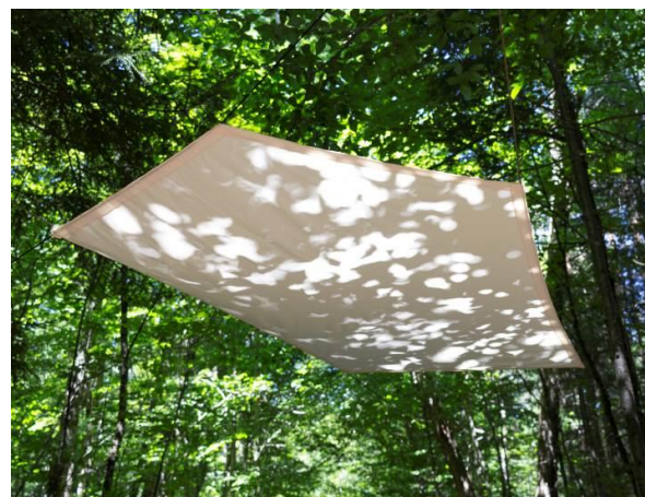
Katie M. Westmoreland, Canopy/Pond (Ghost Flower), 2017, cotton fabric, paracord, landscape photograph of a temporary installation near Wanakena, NY, created during residency at Otto's Abode.