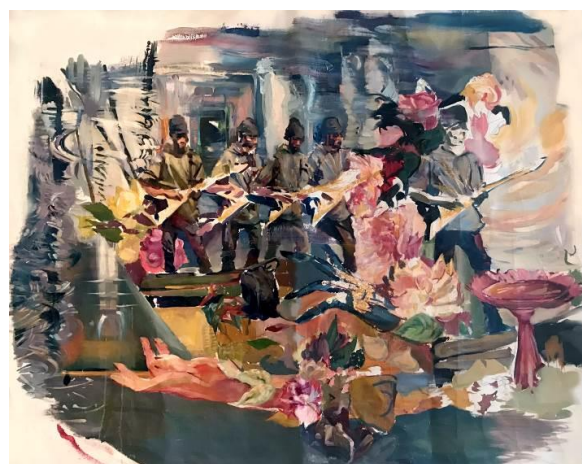
Ashton Agbomenou, Guilty Gear, 2017, oil on polytab, 58 ½ x 63 inches.