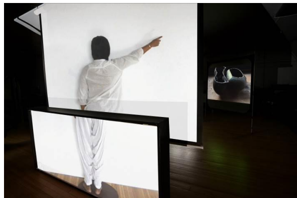
Priyanka Dasgupta & Chad Marshall, Where Straight Lines Fail, 2017 (installation view). Interdisciplinary installation (video, photography, sculpture, archival documents), dimensions variable.