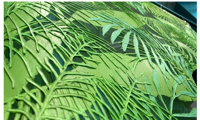
Adrienne Elise Tarver, Egress, 2017, acrylic and caulking on wire mesh, approx. 55 x 48 inches.

The Sunroom provides an engaging setting for artists to contemplate, explore and ultimately transform this unique space. The eight 2018 artists represent a diversity of approaches, including projects that relate to Wave Hill's history and architecture; that engage with our community by working with participants in our public education programs; and that investigate the history of horticulture and botany in unique ways. Each artist participates in a Meet-the-Artist conversation with Eileen Jeng Lynch , Curator of Visual Arts.