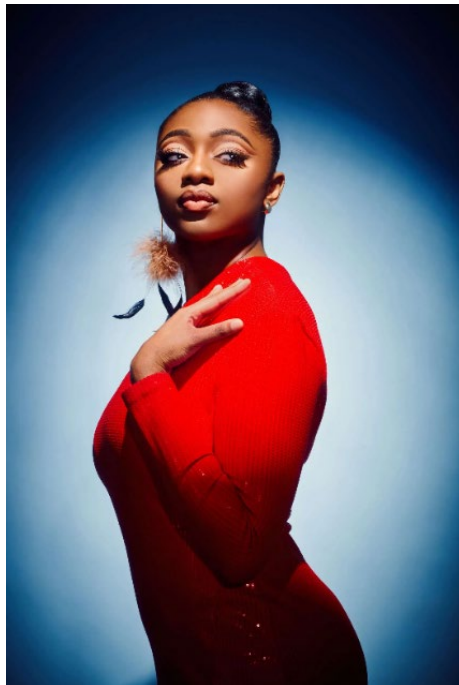
Samara Joy performs August 2.

Fresh off her double Grammy win—Best Jazz Vocal Album and the auspicious Best New Artist award—23-year-old Samara Joy returns to her home borough of the Bronx for a bespoke outdoor concert that’s not to be missed! Praised for “helping jazz take a youthful turn,” ( The New York Times ) and a voice rich and velvety yet precociously refined, Samara has unquestionably cemented her status as the first Gen Z jazz singing star. Advanced tickets required ($15-$50). More about tickets, policies and rain plan at wavehill.org/discover/arts/performing-arts .