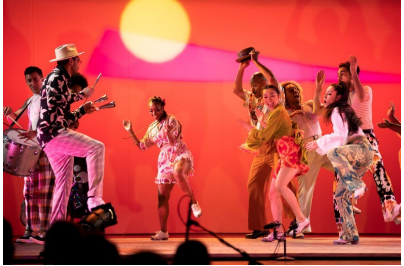
Music From the Sole performs July 5.

Together, the pair embrace shared roots across the diaspora and reflect on racial and cultural identity, while also celebrating the joy, strength, depth and virtuosity of Black dance and music.