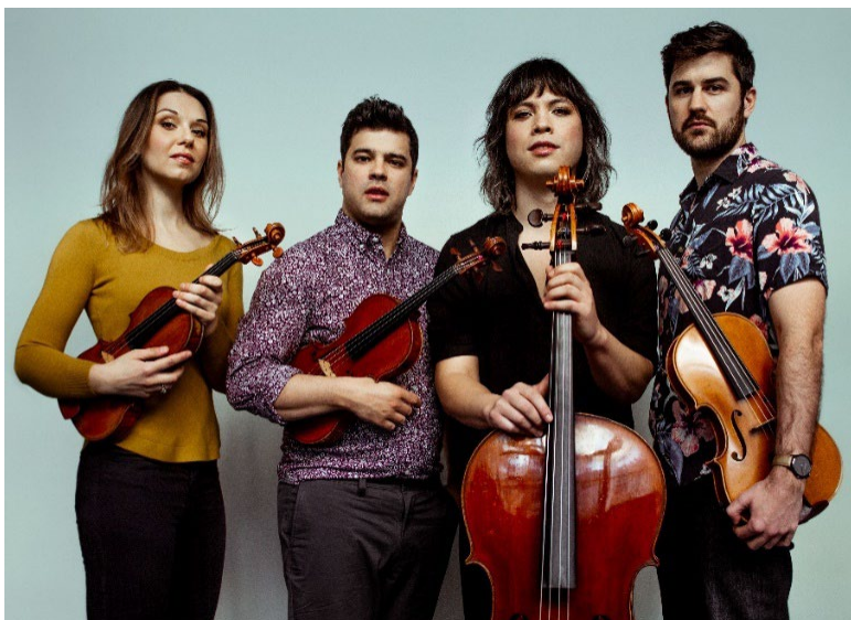
Attacca Quartet performs June 22.