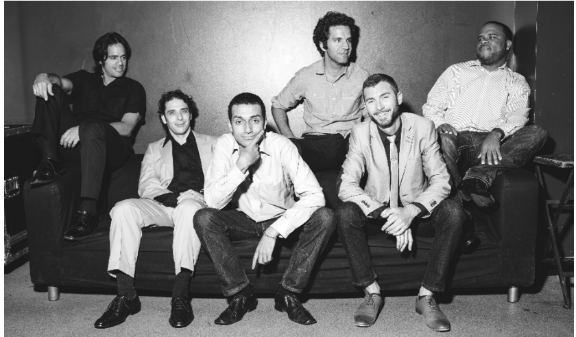
Los Hacheros perform July 26.

Modern-day torchbearers of the Golden Age of Latin music, Brooklyn’s Los Hacheros are reviving folkloric styles like son montuno, guaracha and salsa, infusing their sound with Bomba, a fiery rhythm from the mountains of Puerto Rico.