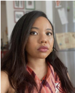
Tao Leigh Goffe.

Tao Leigh Goffe inaugurates the 2024 Sunroom Project Space season with Plot and Provision: Crate-Digging , a climate-art, multimedia installation that explores intergenerational healing through the sounds and soil of the Bronx. Drawing from research on botanicas, botanical gardens, the commons and the segmentation and allocation of land, Goffe’s project manifests as both a site-specific bunker and an archive of gardening rituals across the Caribbean diaspora. Deriving from her own writing on sugarcane plantations and the art of record bin diving to unearth the DNA of musical sounds, she transforms the Sunroom into a space for drafting revolutionary acts across Black and Indigenous cultures. Goffe was born in London, raised between the United Kingdom and Queens, and lives in NYC. She is Associate Professor at Hunter College, CUNY, where she directs the Dark Laboratory , a creative technology collective, production company and design studio.