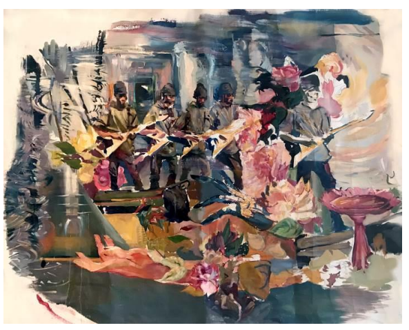
Ashton Agbomenou, Guilty Gear, 2017, oil on polytab, 58 ½ x 63 inches.