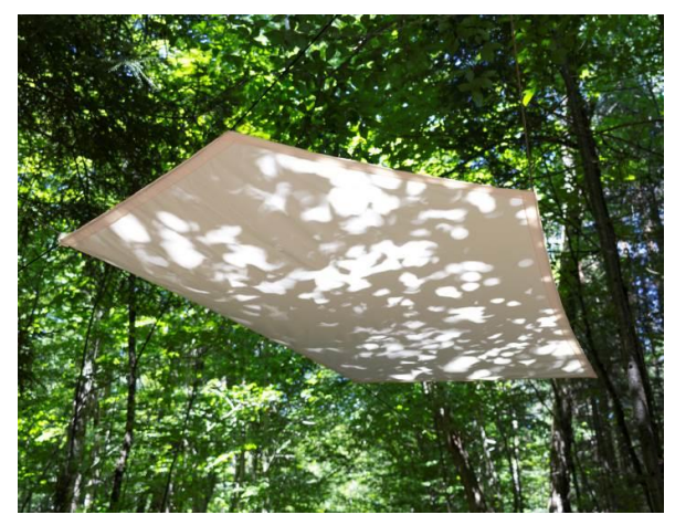
Katie M. Westmoreland , Canopy/Pond (Ghost Flower), 2017, cotton fabric, paracord, landscape photograph of a temporary installation near Wanakena, NY, created during residency at Otto's Abode.