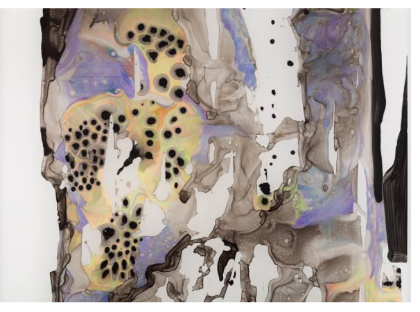
Keren Anavy , Untitled (detail), 2017, ink and colored pencils on transparent Mylar, 118 x 36 inches.

Keren Anavy responds to the late fall landscape of Wave Hill. Suspended from the ceiling, abstract paintings on translucent Mylar dip into shallow pools of ink and correspond to the changing colors of Wave Hill's seasonal plants—especially at the Aquatic Garden. The colored light shining in through the cellophane-covered windows marks the space as an insular, imagined landscape, a conservatory created from human-made materials. In a process that incorporates the element of chance, the artist mimics the relationship between accident and deliberation that occurs in manmade gardens. Meet the Artist: SAT, October 27, 2PM