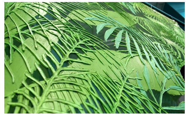
Adrienne Elise Tarver , Egress, 2017 , acrylic and caulking on wire mesh , approx . 55 x 48 inches .